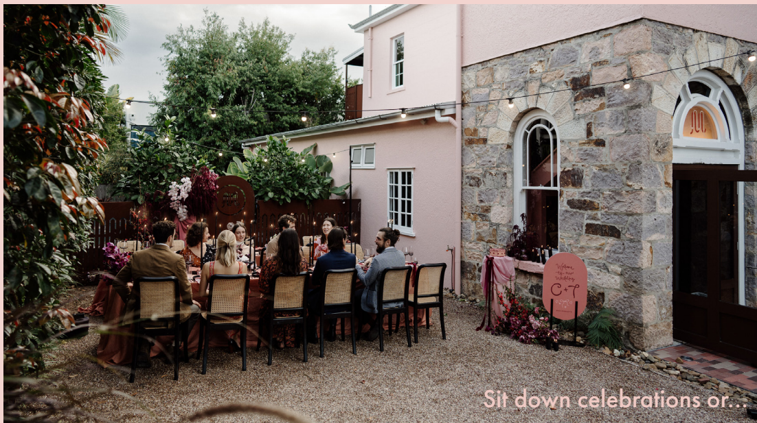
Sit down celebrations or...